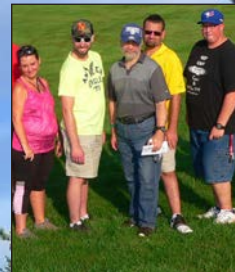
Sp. Olympics golf team