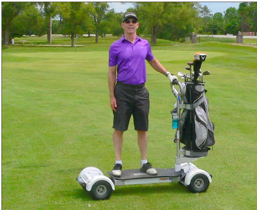
Grey-Bruce Golf Publisher/Editor tries out a golfboard at Southampton Golf and Country Club.

Line-ups outside the door are not uncommon when it's Chicken Wing and Karaoke Night (every Thursday). This brings more younger people into the club and helps change the stereotype that golf courses are stuffy country clubs frequented by older men in funny-looking pants (think Rodney Dangerfield in the movie Caddyshack ).