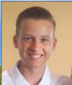
Local golfer meets Hearn